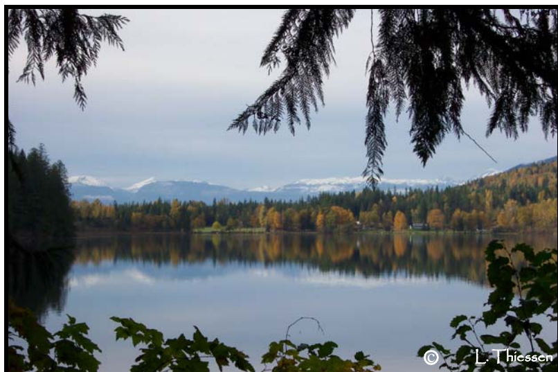
Spectacular foliage framed-view from the Box Lake Forestry campsite

Box Lake Loop is easy travelling on foot and easy to moderate on a bicycle. The extension behind Box Lake provides moderate biking.