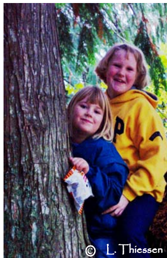
Playing amongst the trees.

* All brochures in the Trails of Nakusp series are available online at : www.nakusparrowlakes.com For more information, try: www.nakusphotosprings.com www.for.gov.bc.ca www.brockies.com www.hellobc.com/bcescapes/regions/brockies.asp wlapwww.gov.bc.ca/bcparks/recreation.htm