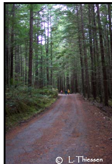
Youngsters love Box Lake Loop

If the Box Lake Loop appealed to you, try Wrap Around Nakusp, Cedar Grove Trail or portions of Rosebery Railway Trail; all are relatively short, easy hikes.